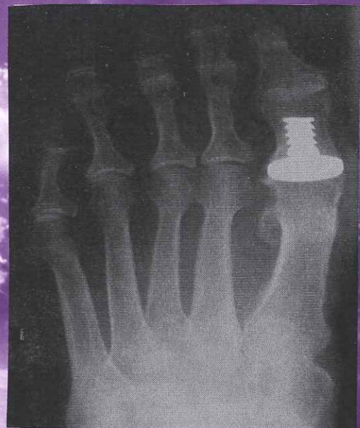
35 year post-op X-ray